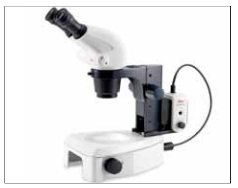
Adapter for the KL200 LED to S-Series Stereomicroscopes.

StereoZoom<sup>®</sup> Leica S6 E with Leica KL200 LED cold light source