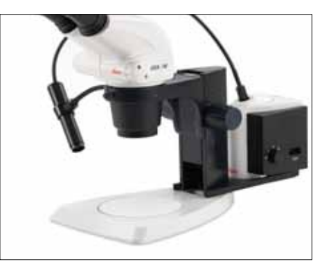
Universal light guides with integrated lenses to provide a focused light output.