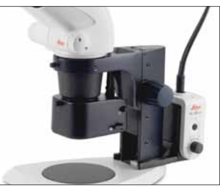
Coaxial illumination for flat reflective objects such as polished metal components, wafers, chips, or layered surfaces.