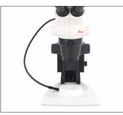
Transmitted light base for prepared slides or semi-transparent specimens.