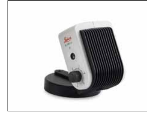
Stand-alone version for mounting the KL200 LED

The KL200 LED offers simple operation combined with an excellent value for your money.