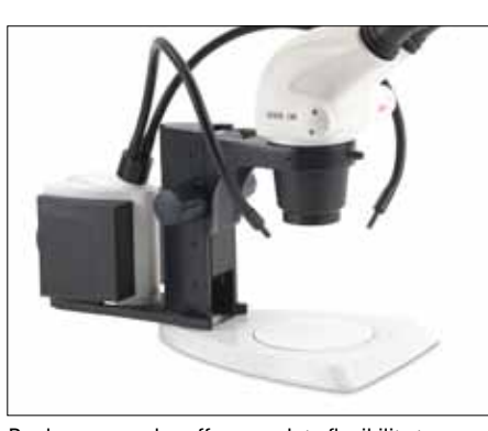
Dual goose necks, offer complete flexibility to illuminate challenging samples.